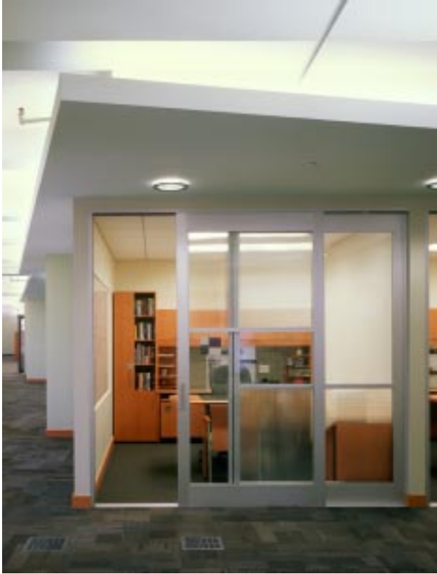
Sliding clear and textured glass walls permit light from perimeter workstations to penetrate the 9-ft. by 12-ft. partners' offices at the core (above left). A suspended, metal mesh ceiling gives the executive conference room (above right) a finished look without detracting from the loft-like atmosphere. Green – and plum-toned panels mask the open plan workstations and enliven the long “Main Street” (opposite).